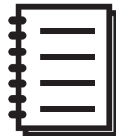
Driver's Records of Duty (ROD)