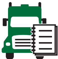
Driver's Motor Vehicle Record (MVR)