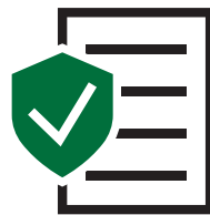
Proof of Insurance