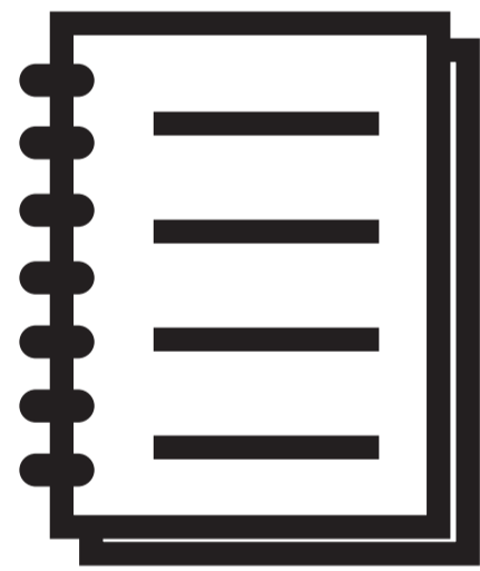
Driver's Records of Duty (ROD)