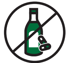
Drug and Alcohol Testing Records