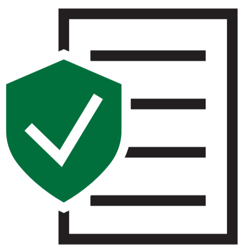
Proof of Insurance